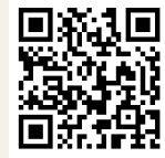
Table orders via the QR code on the table OR Please Order & Pay at the Counter

See our SPECIALS BOARD for tasty options